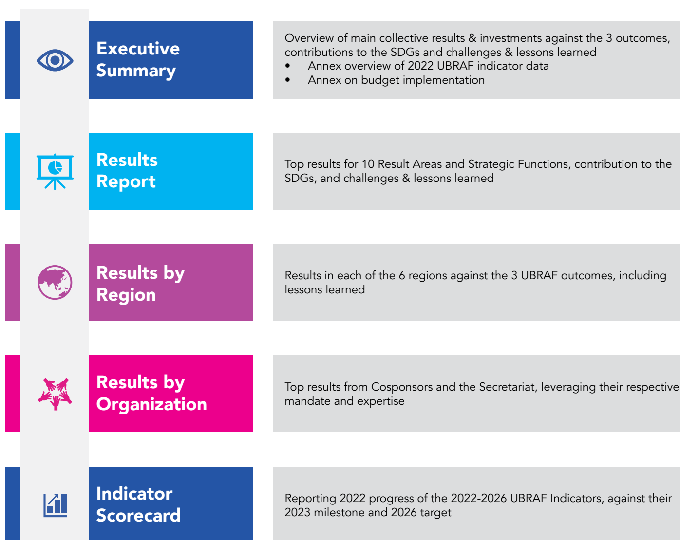
Figure 1. 2022 UNAIDS Performance Monitoring Report package

Complemented by the UNAIDS Results & Transparency Portal, including country reports & infographics