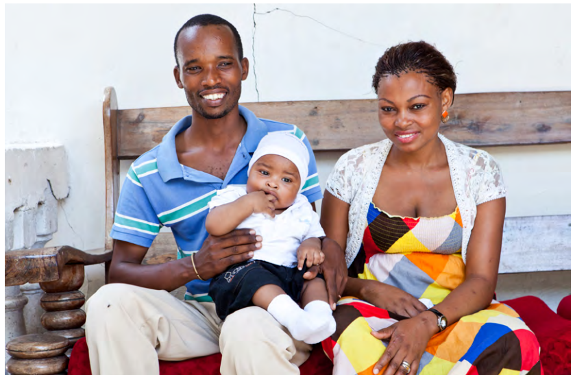
A family at their home in Dar es Salaam, United Republic of Tanzania.