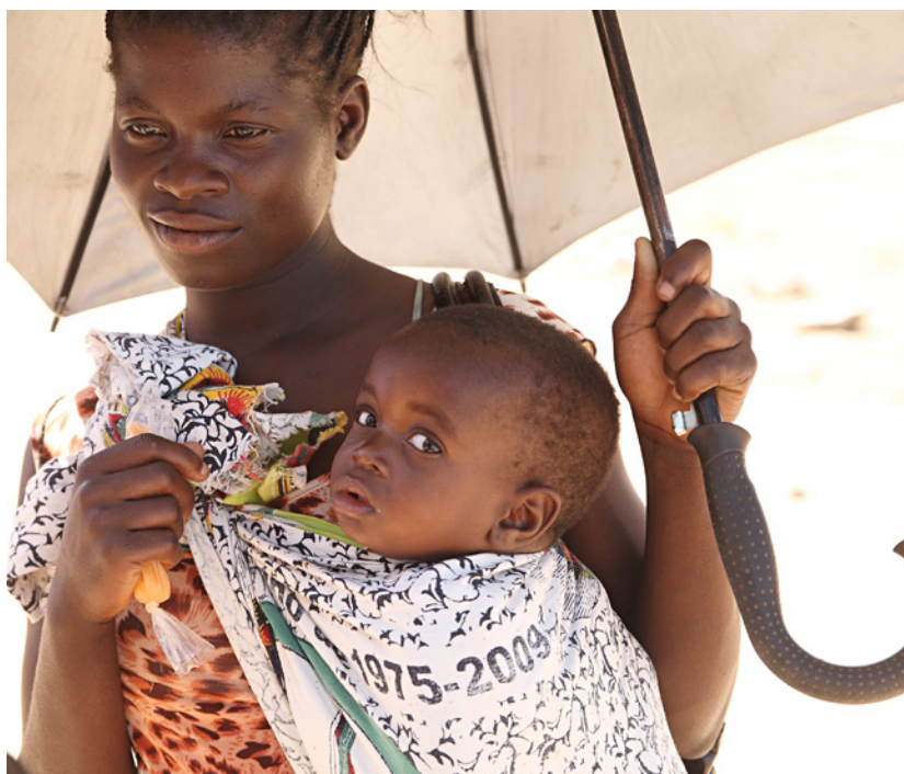
Adolescent mother, stakeholder of the Flemish Development Cooperation – Tete, Mozambique.

To address this imbalance, UNAIDS has developed the HIV Gender Assessment Tool , a detailed plan to support countries to assess their HIV epidemic, context and response from a gender perspective. This multipartner process allows countries to identify gaps, develop gender-specific programmes and policies, and include key recommendations in national strategic plans, country investment cases and submissions to the Global Fund to Fight AIDS, Tuberculosis