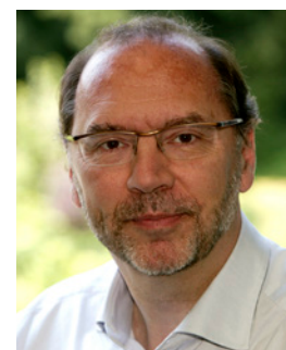
Flanders native, Dr Peter Piot, was Executive Director of UNAIDS from its creation in 1995 until the end of 2008.

Estimates show that around half of all sex workers in Eswatini, Lesotho, Malawi, South Africa and Zimbabwe are living with HIV. In South Africa, UNAIDS reviews and provides direct inputs into the National Sex Worker HIV Plan to ensure equal access to health and legal services for sex workers. UNAIDS also supports civil society AIDS responses with their target achievement, data collection and reporting, and linkages with other programmes and campaigns. Finally, UNAIDS works closely with sex worker organizations and supports their participation in national, regional and global consultations and fora.